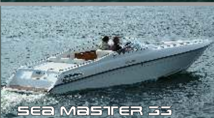
SEA MASTER 33