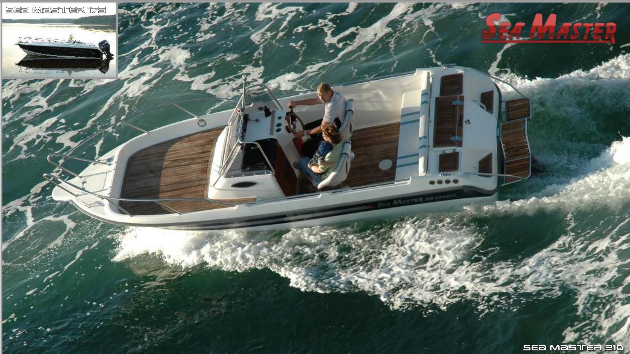
SEA MASTER 210