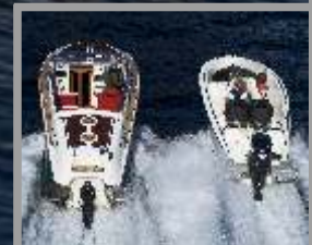
VENUS 20 & VENUS 29