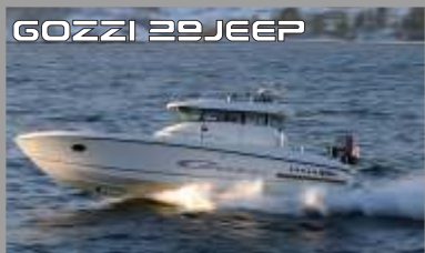
GOZZI 29 JEEP