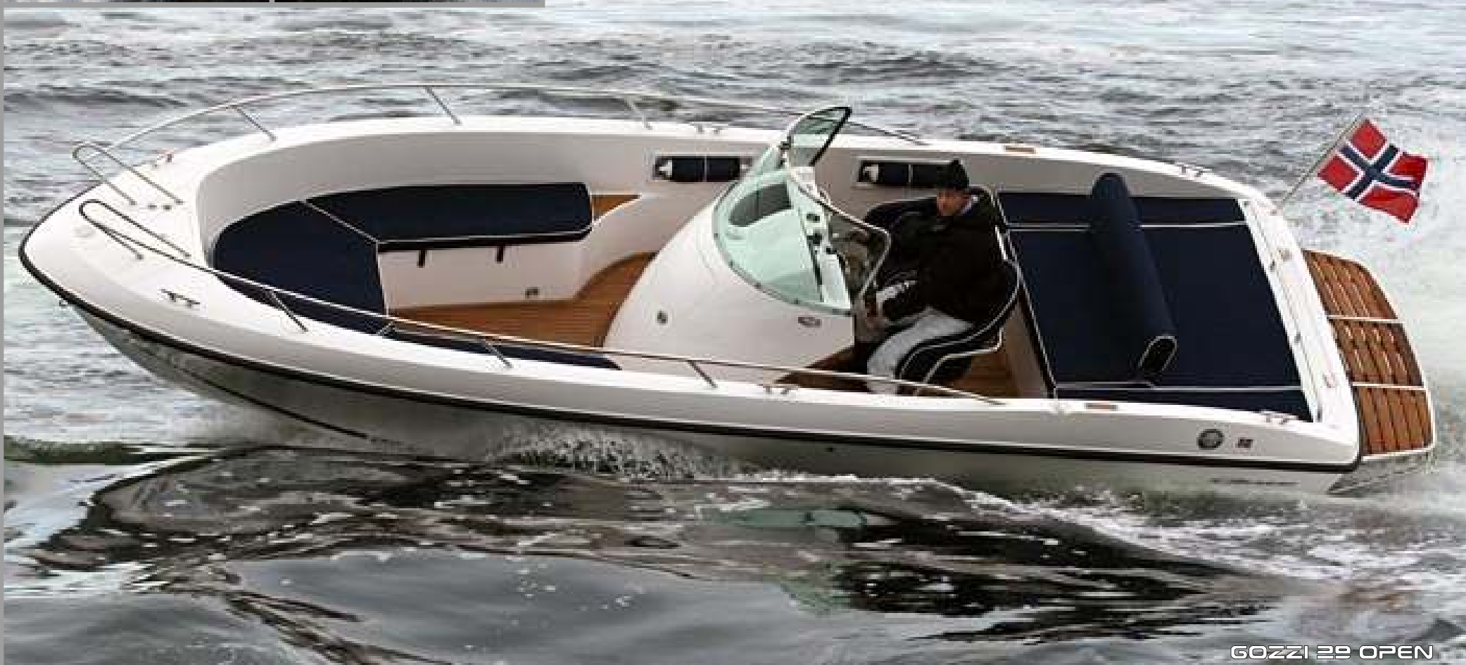
GOZZI 29 OPEN